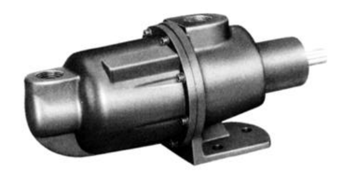
Packing Gland Models