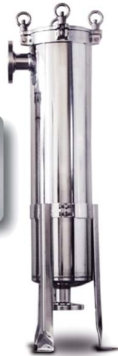
Electro-Polished Nowata SNB Side Entry, Single Bag Filter Housing with ANSI Flanged Inlet and Outlet